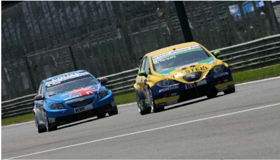
SEAT León TDI and Chevrolet Cruze remain the heaviest cars in Zolder