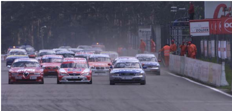
The FIA touring cars return to Zolder nine years after the 2001 ETCC